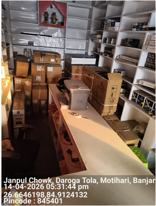
Photo of Machinery Setup