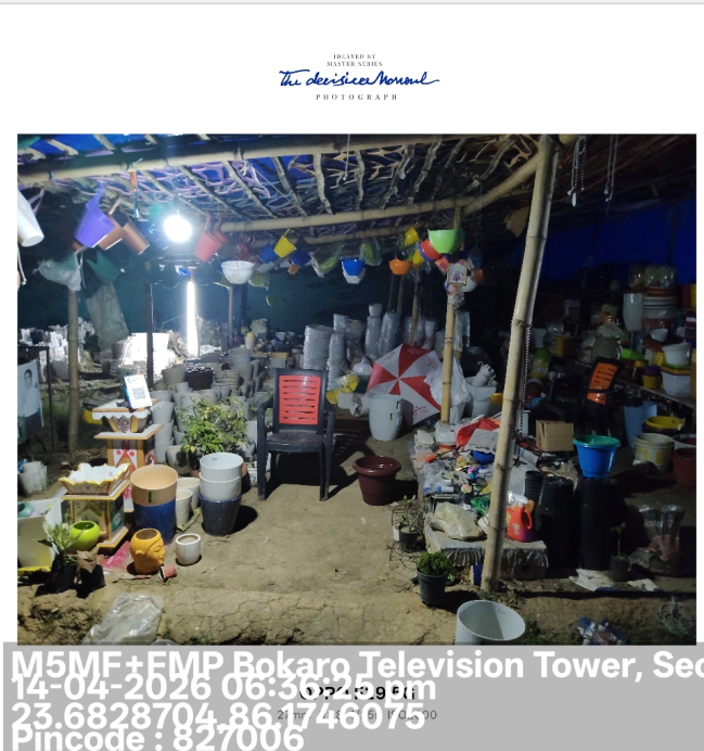
M5MF+FMP Bokaro Television Tower, Sect 14-04-2026 06:36:25 pm OPPO F29 5G 23.6828704,86.1746075 Pincode : 827006

Shop front with horizontal view covering the left & right of the shop establishing if the shop is an individual structure, in a marketplace, highway, isolated place, in a cluster framework.