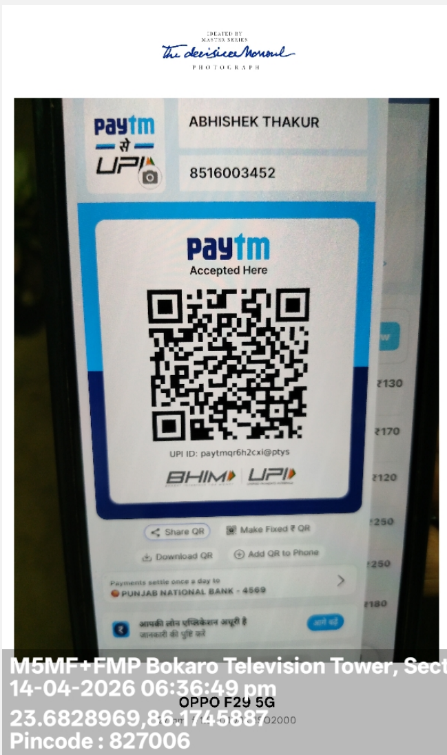
M5MF+FMP Bokaro Television Tower, Sect 14-04-2026 06:36:49 pm OPPO F29 5G 23.6828969,86.1745887 Pincode : 827006

Take Photo of QR Code/Soundbox/EDC Machine