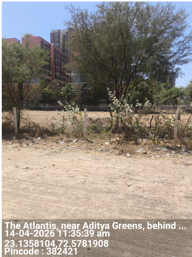
The Atlantis, near Aditya Greens, behind ... 14-04-2026 11:35:39 am 23.1358104,72.5781908 Pincode : 382421

Take Photo if Name Plate / Address plate – Available