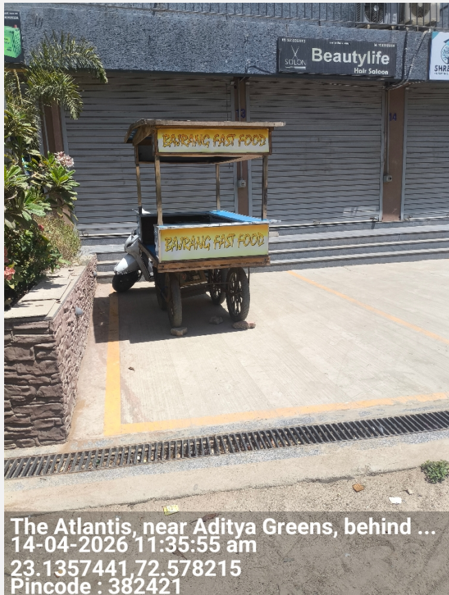
The Atlantis, near Aditya Greens, behind ... 14-04-2026 11:35:55 am 23.1357441,72.578215 Pincode : 382421

Shop front photo with full vertical viewpoint i.e; shop board, sealing, entrance, ground on which the shop is established (cemented, pilers, bricks, stands, mud, wheels etc.)