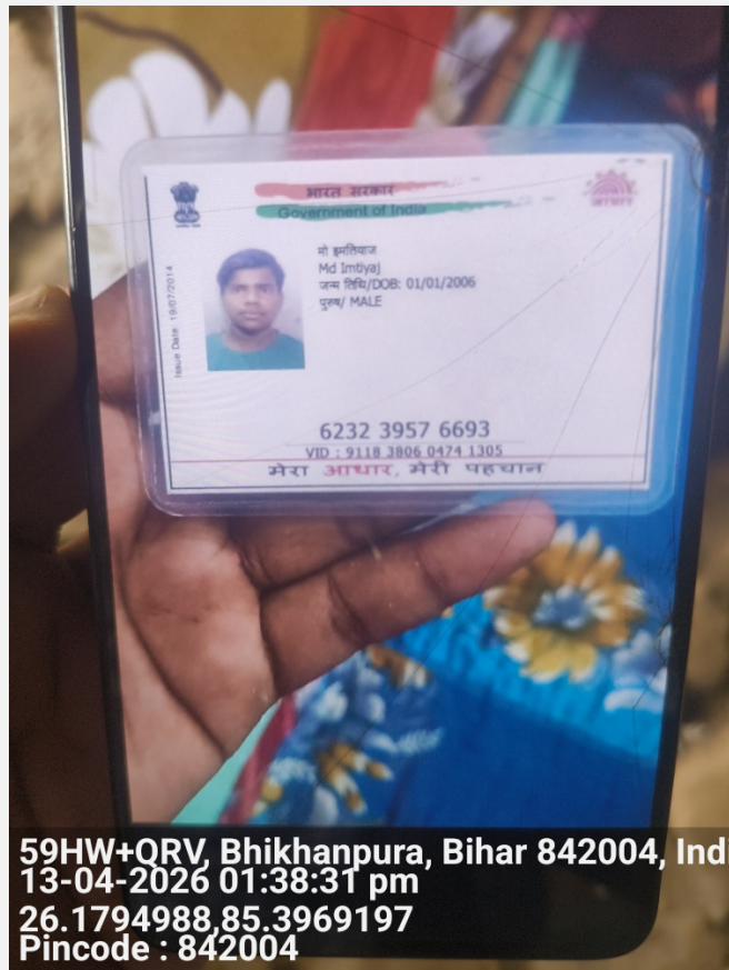
Photo of ID Proof