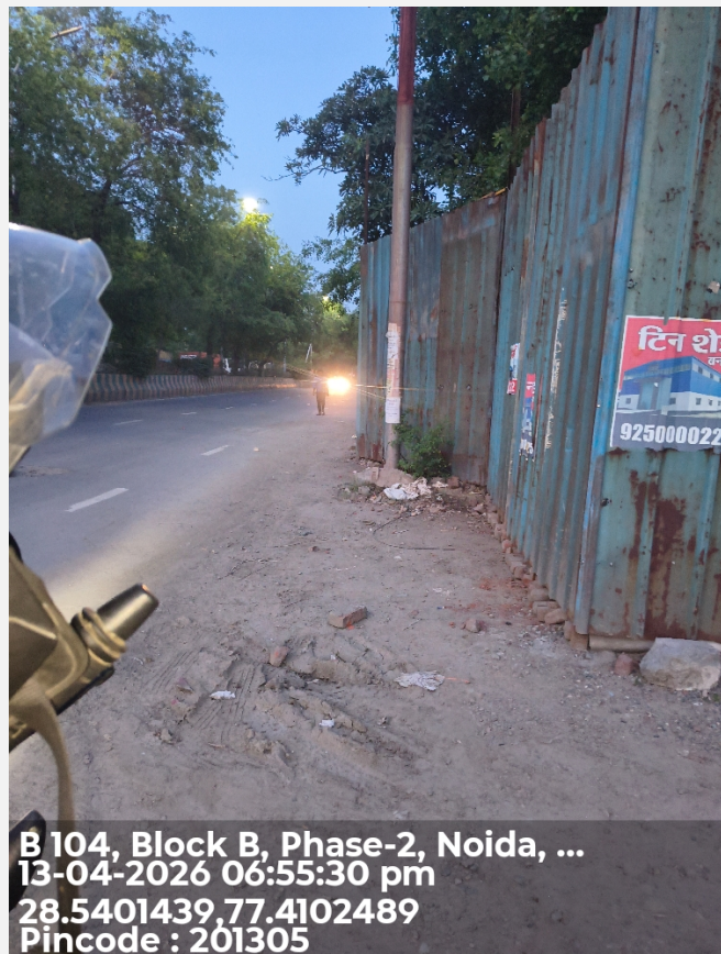
B 104, Block B, Phase-2, Noida, ... 13-04-2026 06:55:30 pm 28.5401439,77.4102489 Pincode : 201305

Shop inside with inventory photos establishing that the inside is of the same shop where the front photo was taken