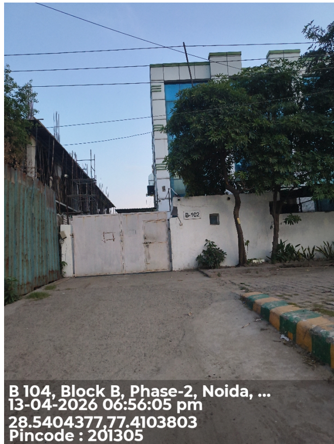
B 104, Block B, Phase-2, Noida, ... 13-04-2026 06:56:05 pm 28.5404377,77.4103803 Pincode : 201305

Shop front with horizontal view covering the left & right of the shop establishing if the shop is an individual structure, in a marketplace, highway, isolated place, in a cluster framework.