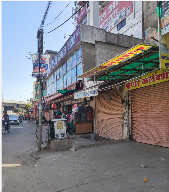
Ramji Kripa Apartment, Bajrang Colony, Jhosi 13-04-2026 09:55:57 am 26.9421091,75.7628197 Pincode : 302012

Shop front with horizontal view covering the left & right of the shop establishing if the shop is an individual structure, in a marketplace, highway, isolated place, in a cluster framework.