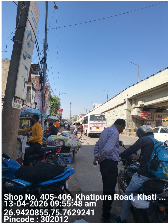
Shop No. 405-406, Khatipura Road, Khati ... 13-04-2026 09:55:48 am 26.9420855,75.7629241 Pincode : 302012

Shop inside with inventory photos establishing that the inside is of the same shop where the front photo was taken