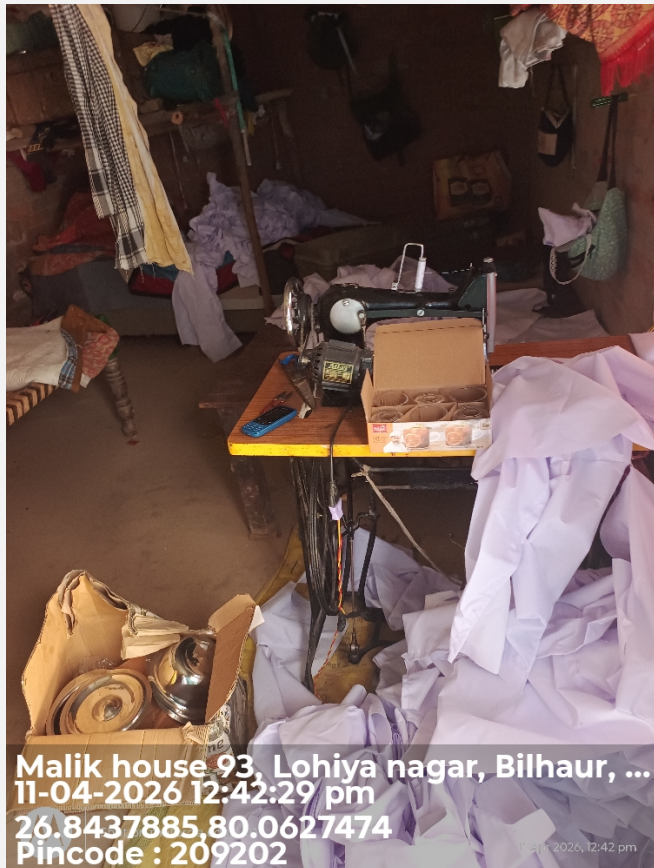
Malik house 93, Lohiya nagar, Bilhaur, ... 11-04-2026 12:42:29 pm 26.8437885,80.0627474 Pincode : 209202

Shop inside with inventory photos establishing that the inside is of the same shop where the front photo was taken