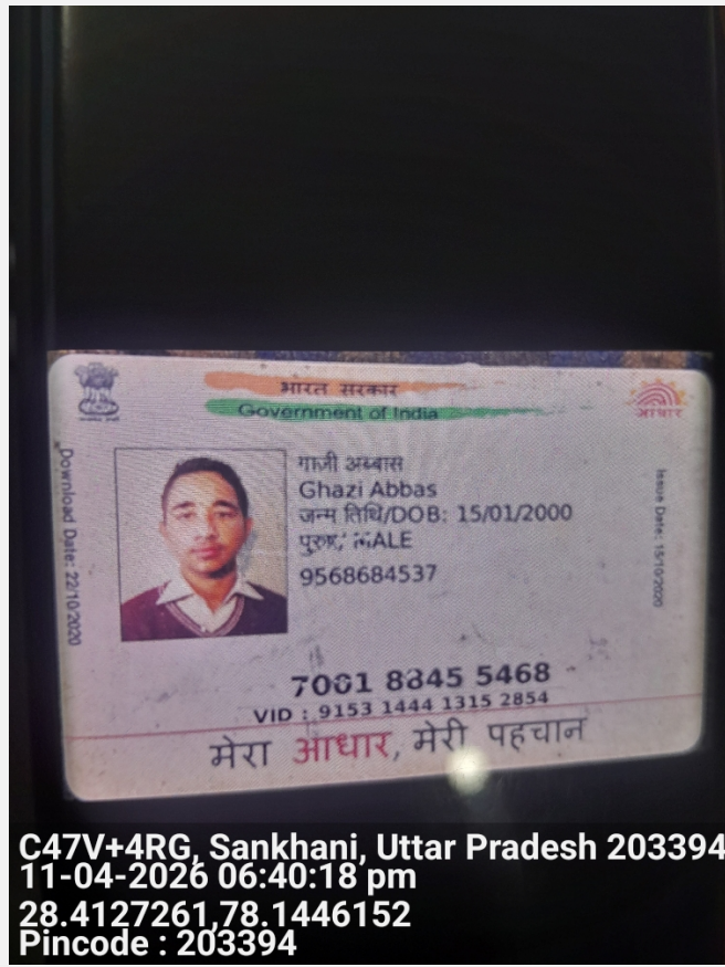
Photo of ID Proof