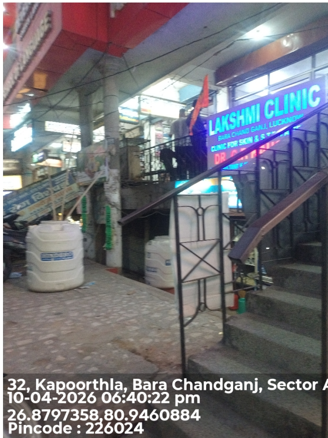
32, Kapoorthla, Bara Chandganj, Sector A 10-04-2026 06:40:22 pm 26.8797358,80.9460884 Pincode : 226024

Shop front photo with full vertical viewpoint i.e; shop board, sealing, entrance, ground on which the shop is established (cemented, pilers, bricks, stands, mud, wheels etc.)