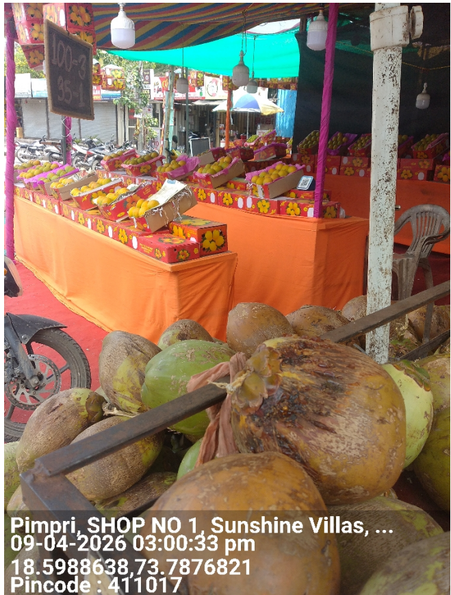
Pimpri, SHOP NO 1, Sunshine Villas, ... 09-04-2026 03:00:33 pm 18.5988638,73.7876821 Pincode : 411017

Shop inside with inventory photos establishing that the inside is of the same shop where the front photo was taken