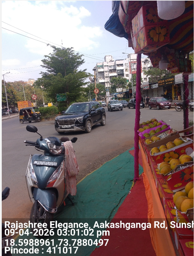
Rajashree Elegance, Aakashganga Rd, Sunshine Villas 09-04-2026 03:01:02 pm 18.5988961,73.7880497 Pincode : 411017

Shop front with horizontal view covering the left & right of the shop establishing if the shop is an individual structure, in a marketplace, highway, isolated place, in a cluster framework.