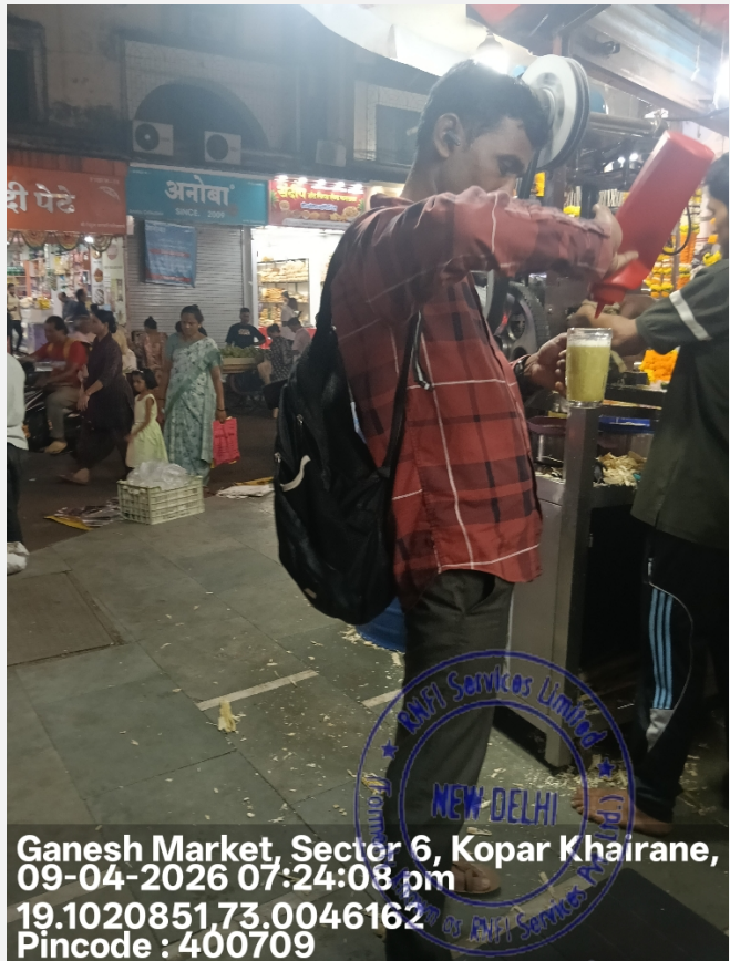
Ganesh Market, Sector 6, Kopar Khairane, 09-04-2026 07:24:08 pm 19.1020851,73.0046162 Pincode : 400709