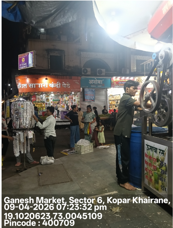
Ganesh Market, Sector 6, Kopar Khairane, 09-04-2026 07:23:32 pm 19.1020623,73.0045109 Pincode : 400709

Shop inside with inventory photos establishing that the inside is of the same shop where the front photo was taken