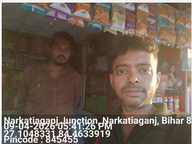
Photo with Agent