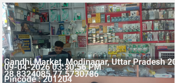
Photo of Stock