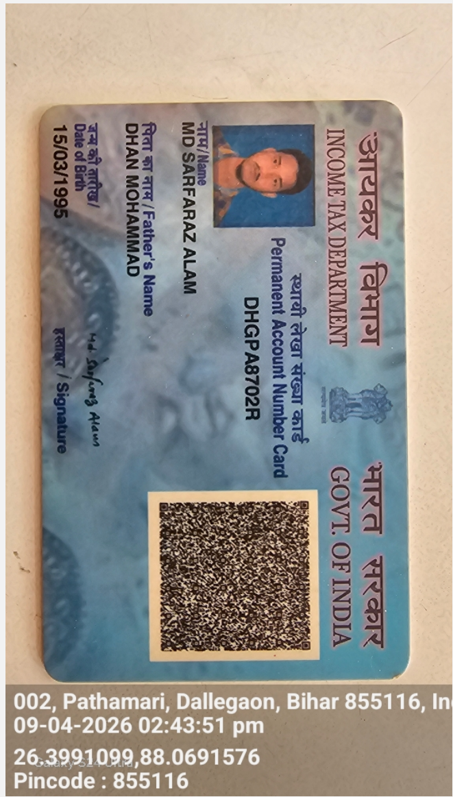
Photo of ID Proof