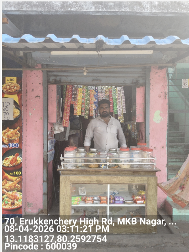
70, Erukkenchery High Rd, MKB Nagar, ... 08-04-2026 03:11:21 PM 13.1183127,80.2592754 Pincode : 600039

Shop front with horizontal view covering the left & right of the shop establishing if the shop is an individual structure, in a marketplace, highway, isolated place, in a cluster framework.