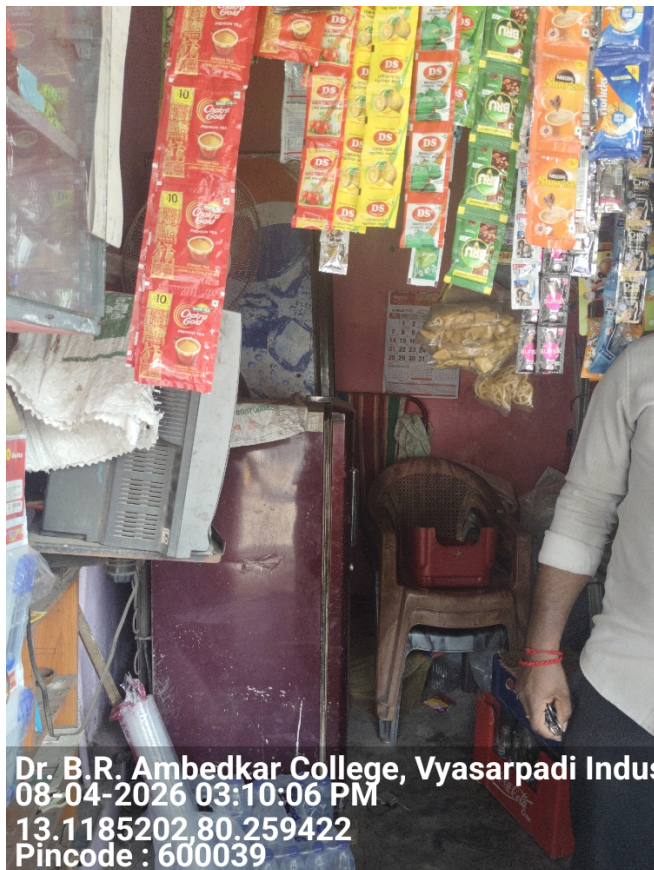
Dr. B.R. Ambedkar College, Vyasarpadi Indus 08-04-2026 03:10:06 PM 13.1185202,80.259422 Pincode : 600039

Shop inside with inventory photos establishing that the inside is of the same shop where the front photo was taken