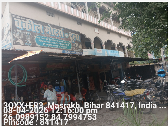
Photo of Outside Shop