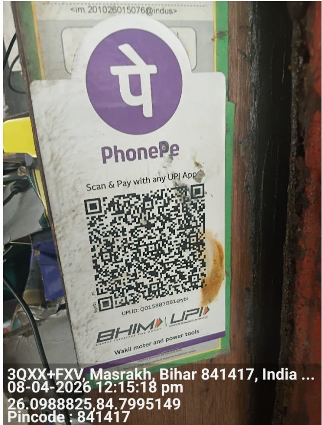
Photo with UPI Scanner