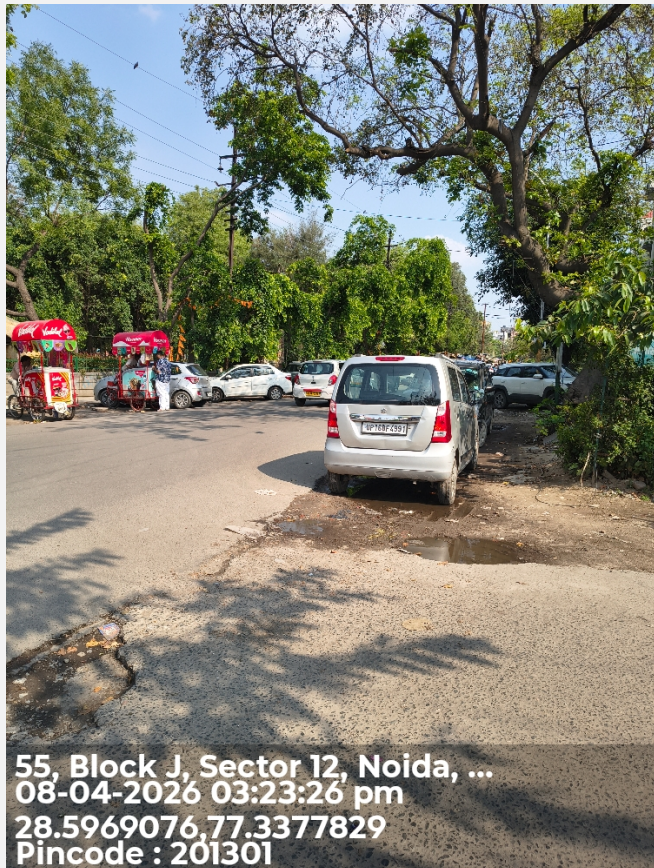
55, Block J, Sector 12, Noida, ... 08-04-2026 03:23:26 pm 28.5969076,77.3377829 Pincode : 201301

Shop inside with inventory photos establishing that the inside is of the same shop where the front photo was taken