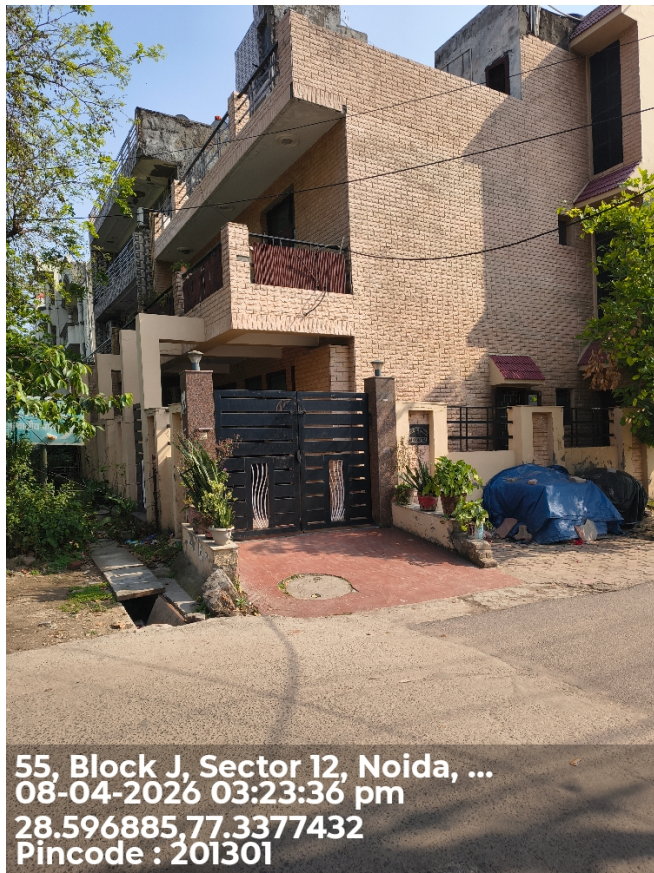
55, Block J, Sector 12, Noida, ... 08-04-2026 03:23:36 pm 28.596885,77.3377432 Pincode : 201301

Shop front with horizontal view covering the left & right of the shop establishing if the shop is an individual structure, in a marketplace, highway, isolated place, in a cluster framework.