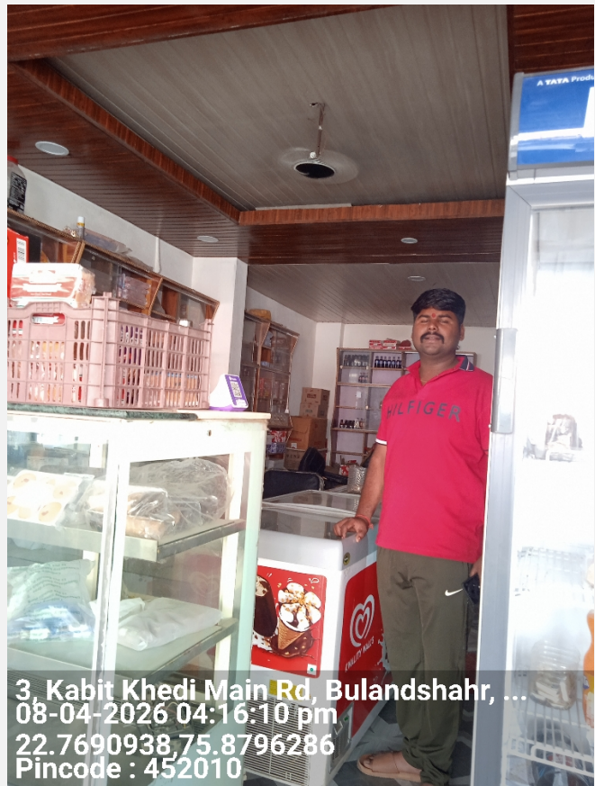
3, Kabit Khedi Main Rd, Bulandshahr, ... 08-04-2026 04:16:10 pm 22.7690938,75.8796286 Pincode : 452010

Shop front photo with full vertical viewpoint i.e; shop board, sealing, entrance, ground on which the shop is established (cemented, pilers, bricks, stands, mud, wheels etc.)