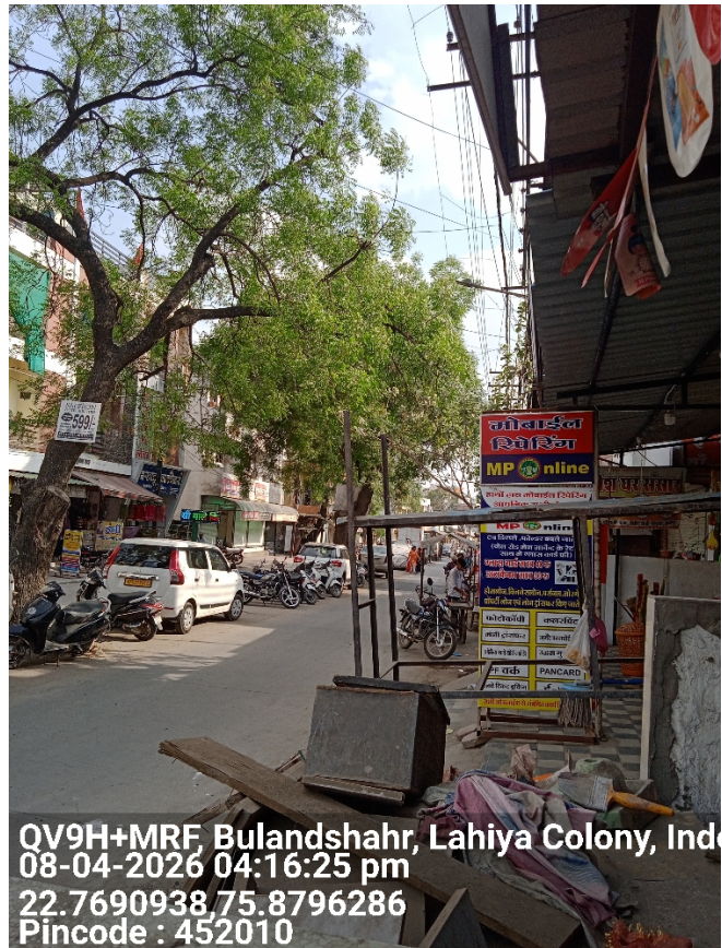
QV9H+MRF, Bulandshahr, Lahiya Colony, Ind 08-04-2026 04:16:25 pm 22.7690938,75.8796286 Pincode : 452010

Take Photo of Person Met Inside the Shop