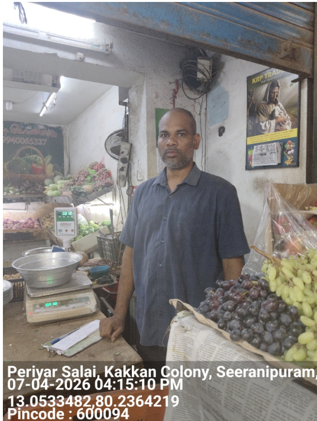
Periyar Salai, Kakkan Colony, Seeranipuram, 07-04-2026 04:15:10 PM 13.0533482,80.2364219 Pincode : 600094

Take Photo of Person Met Inside the Shop