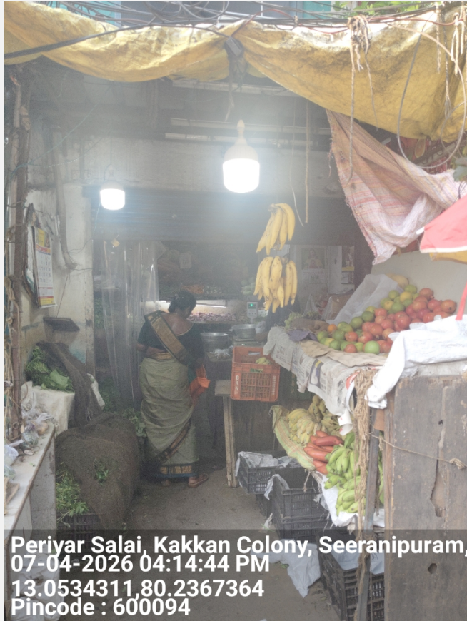
Periyar Salai, Kakkan Colony, Seeranipuram, 07-04-2026 04:14:44 PM 13.0534311,80.2367364 Pincode : 600094

Shop front photo with full vertical viewpoint i.e; shop board, sealing, entrance, ground on which the shop is established (cemented, pilers, bricks, stands, mud, wheels etc.)