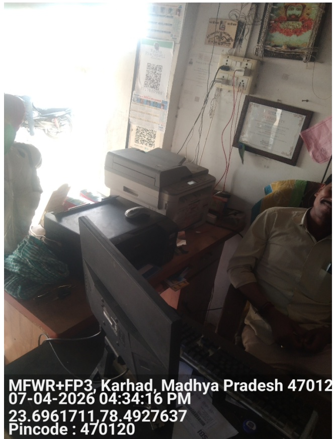
Photo of Machinery Setup