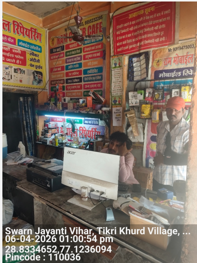
Swarn Jayanti Vihar, Tikri Khurd Village, ... 06-04-2026 01:00:54 pm 28.8334652,77.1236094 Pincode : 110036