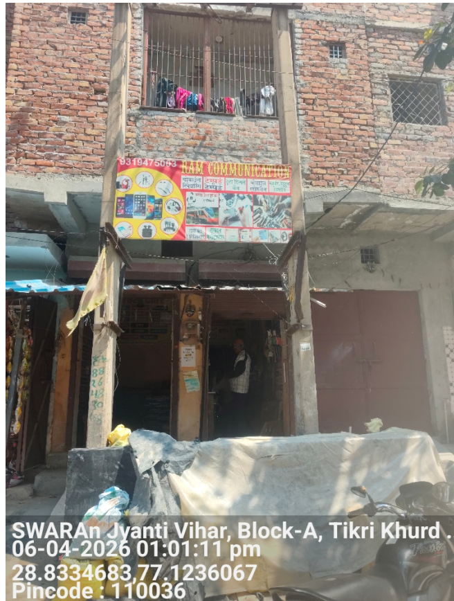
SWARAn Jyanti Vihar, Block-A, Tikri Khurd . 06-04-2026 01:01:11 pm 28.8334683,77.1236067 Pincode : 110036