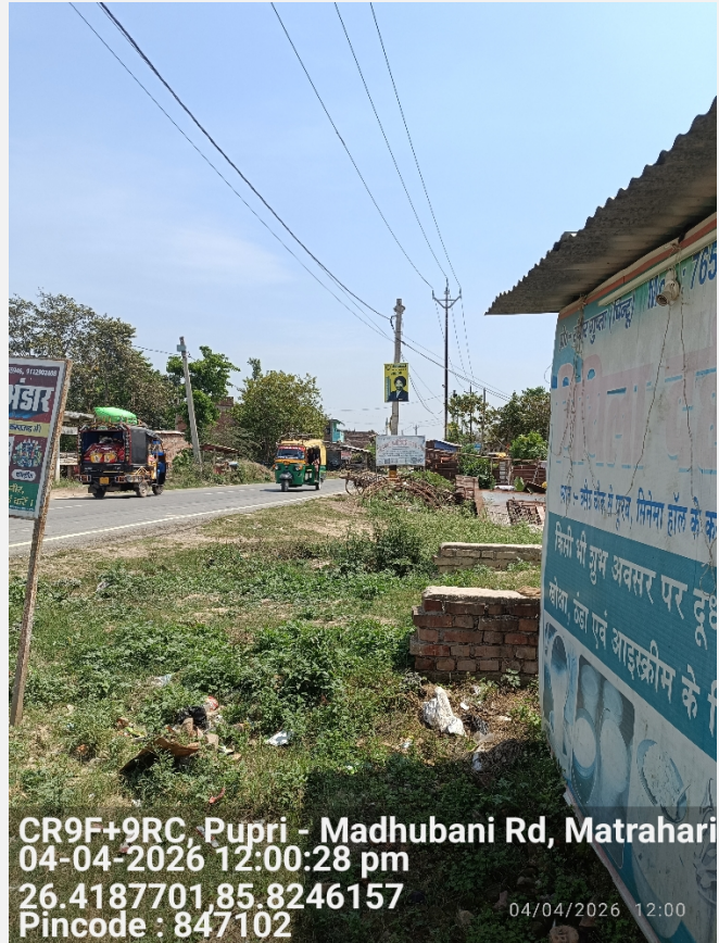
Photo of Outside Shop