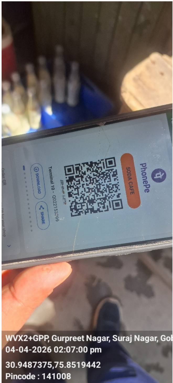
Photo with UPI Scanner