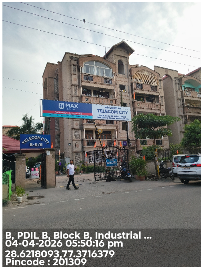
B, PDIL B, Block B, Industrial ... 04-04-2026 05:50:16 pm 28.6218093,77.3716379 Pincode : 201309

Shop front with horizontal view covering the left & right of the shop establishing if the shop is an individual structure, in a marketplace, highway, isolated place, in a cluster framework.