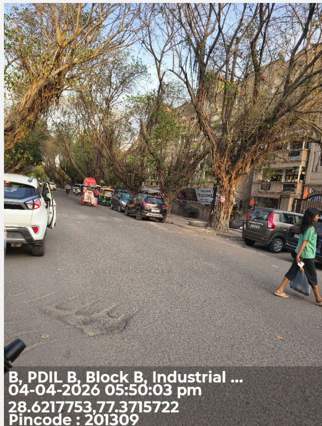
B, PDIL B, Block B, Industrial ... 04-04-2026 05:50:03 pm 28.6217753,77.3715722 Pincode : 201309

Shop inside with inventory photos establishing that the inside is of the same shop where the front photo was taken