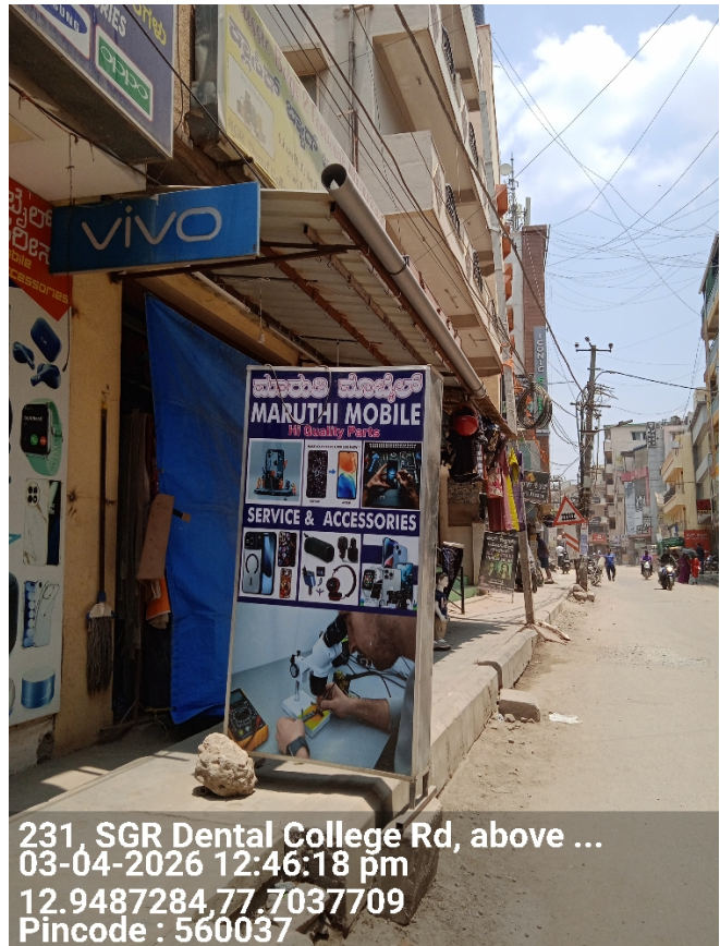
231, SGR Dental College Rd, above ... 03-04-2026 12:46:18 pm 12.9487284,77.7037709 Pincode : 560037

Shop inside with inventory photos establishing that the inside is of the same shop where the front photo was taken