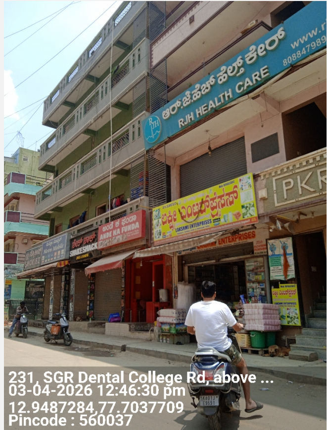
231, SGR Dental College Rd, above ... 03-04-2026 12:46:30 pm 12.9487284,77.7037709 Pincode : 560037

Shop front with horizontal view covering the left & right of the shop establishing if the shop is an individual structure, in a marketplace, highway, isolated place, in a cluster framework.