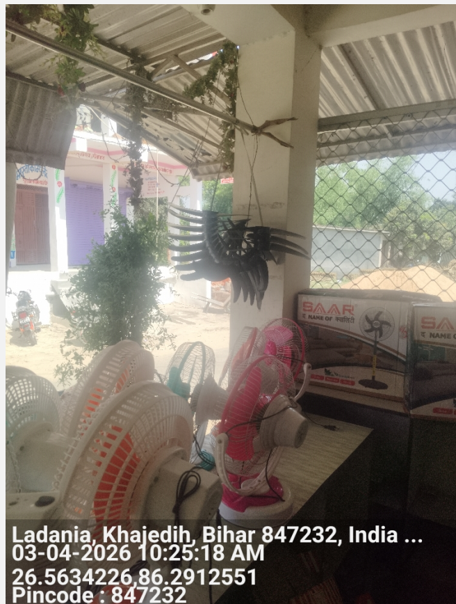
Photo of Outside Shop