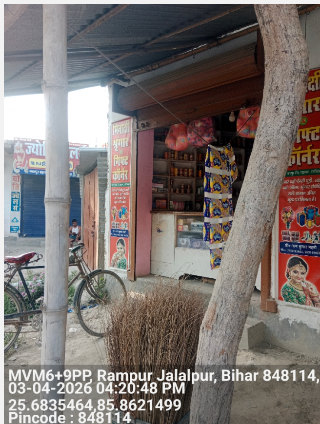
Photo of Stock