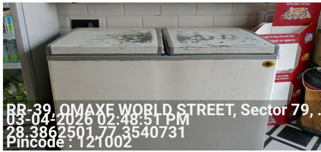
Photo of Machinery Setup