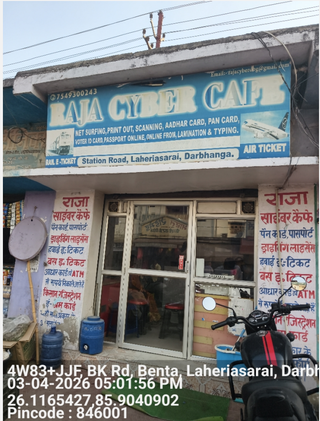
Shop Photo Outside

4W83+JJF, BK Rd, Benta, Laheriasarai, Darbhanga 03-04-2026 05:01:56 PM 26.1165427, 85.9040902 Pincode : 846001