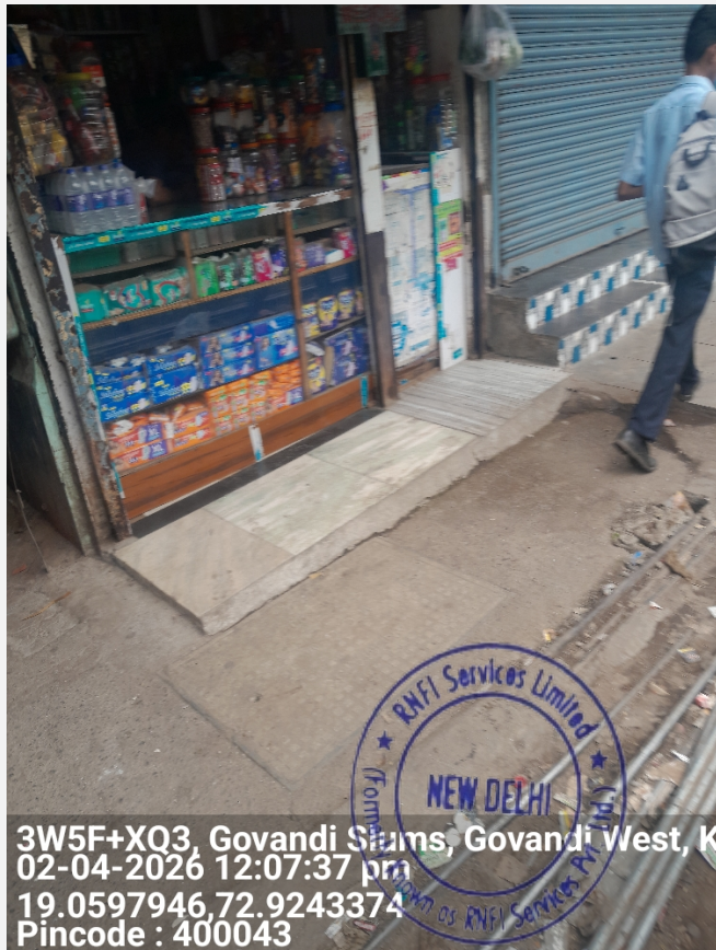
3W5F+XQ3, Govandi Slums, Govandi West, K... 02-04-2026 12:07:37 pm 19.0597946,72.9243374 Pincode : 400043