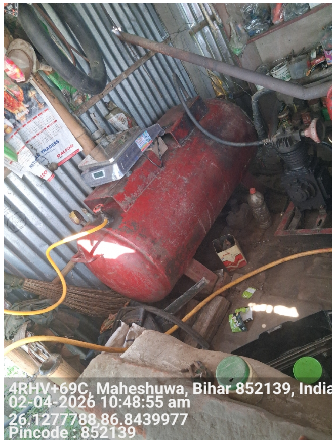
Photo of Machinery Setup