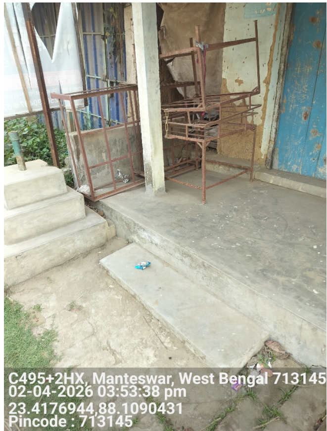
Photo of Machinery Setup