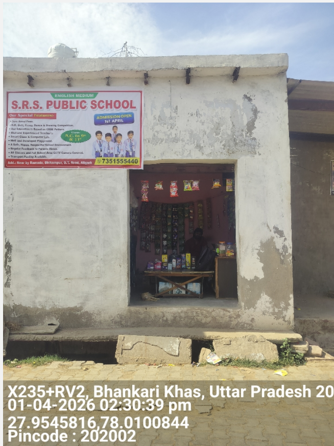
X235+RV2, Bhankari Khas, Uttar Pradesh 20 01-04-2026 02:30:39 pm 27.9545816,78.0100844 Pincode : 202002

Shop front with horizontal view covering the left & right of the shop establishing if the shop is an individual structure, in a marketplace, highway, isolated place, in a cluster framework.