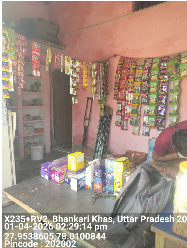
X235+RV2, Bhankari Khas, Uttar Pradesh 20 01-04-2026 02:29:14 pm 27.9538605,78.0100844 Pincode : 202002

Shop inside with inventory photos establishing that the inside is of the same shop where the front photo was taken