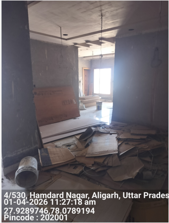
Photo of Stock