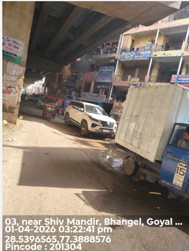
03, near Shiv Mandir, Bhangel, Goyal ... 01-04-2026 03:22:41 pm 28.5396565,77.3888576 Pincode : 201304

Shop inside with inventory photos establishing that the inside is of the same shop where the front photo was taken