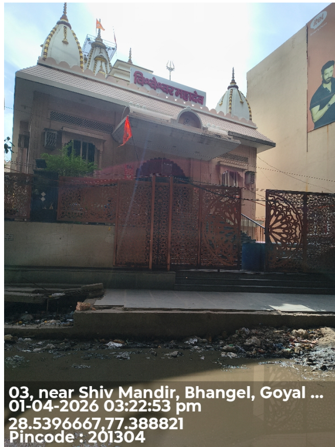
03, near Shiv Mandir, Bhangel, Goyal ... 01-04-2026 03:22:53 pm 28.5396667,77.388821 Pincode : 201304

Shop front with horizontal view covering the left & right of the shop establishing if the shop is an individual structure, in a marketplace, highway, isolated place, in a cluster framework.