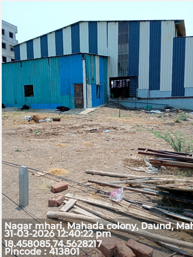
Photo of Outside Shop