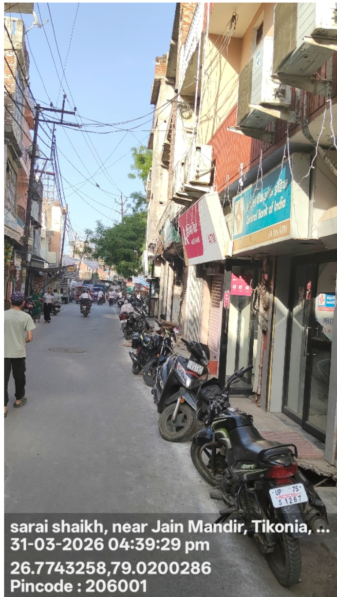
Photo with Agent