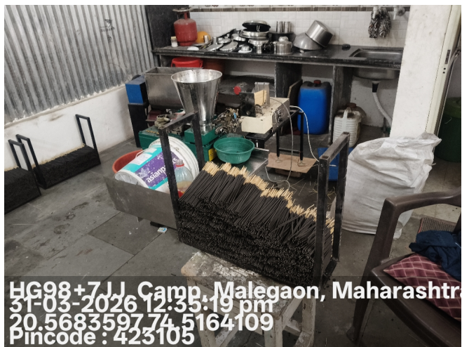
Photo of Machinery Setup