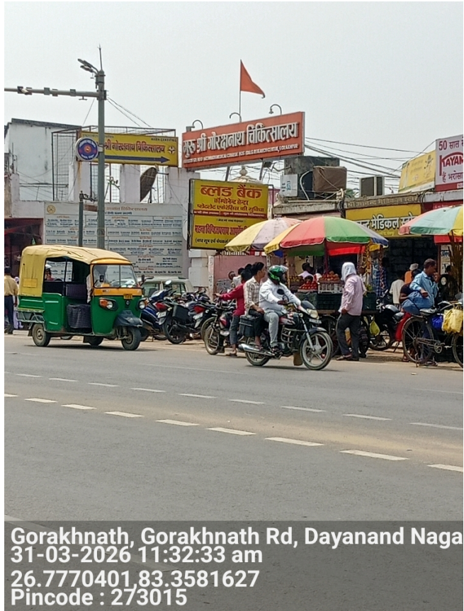
Gorakhnath, Gorakhnath Rd, Dayanand Naga 31-03-2026 11:32:33 am 26.7770401,83.3581627 Pincode : 273015