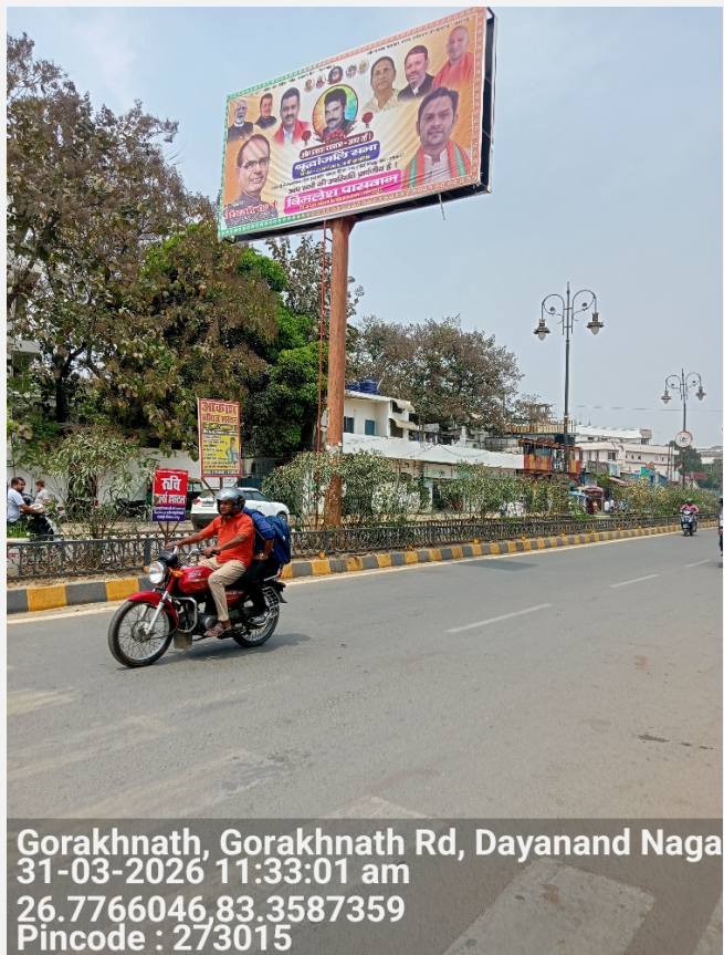
Gorakhnath, Gorakhnath Rd, Dayanand Naga 31-03-2026 11:33:01 am 26.7766046,83.3587359 Pincode : 273015