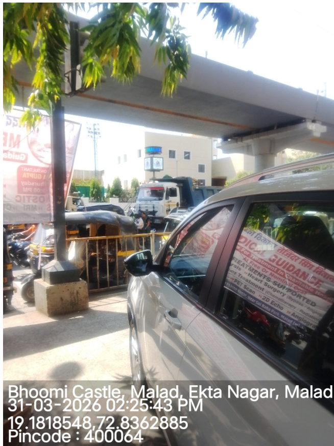
Bhoomi Castle, Malad, Ekta Nagar, Malad 31-03-2026 02:25:43 PM 19.1818548,72.8362885 Pincode : 400064

Shop inside with inventory photos establishing that the inside is of the same shop where the front photo was taken