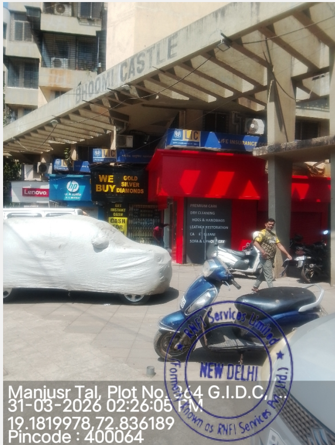
Maniusr Tal, Plot No. 264 G.I.D.C., 31-03-2026 02:26:05 PM 19.1819978,72.836189 Pincode : 400064