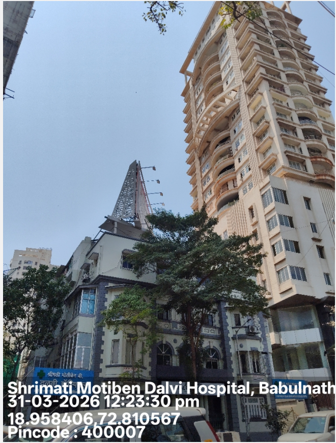
Shrimati Motiben Dalvi Hospital, Babulnath 31-03-2026 12:23:30 pm 18.958406,72.810567 Pincode : 400007

Shop front with horizontal view covering the left & right of the shop establishing if the shop is an individual structure, in a marketplace, highway, isolated place, in a cluster framework.