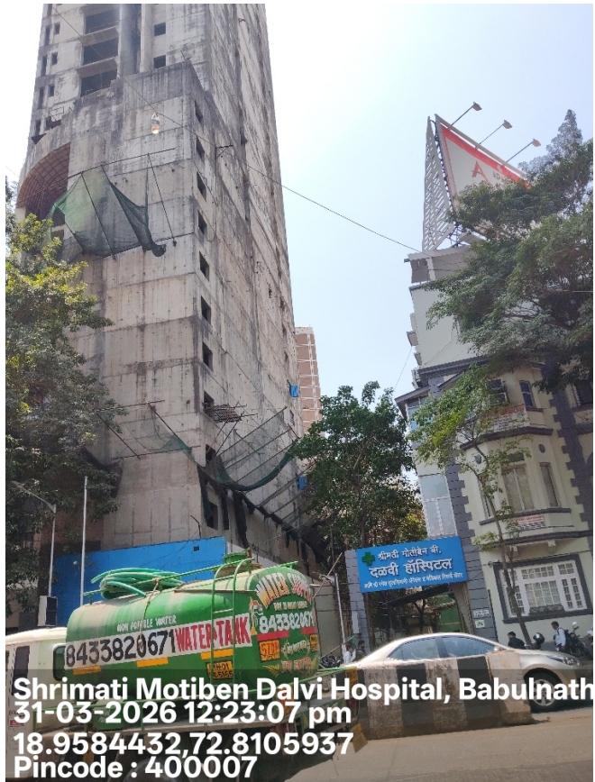
Shrimati Motiben Dalvi Hospital, Babulnath 31-03-2026 12:23:07 pm 18.9584432,72.8105937 Pincode : 400007

Shop inside with inventory photos establishing that the inside is of the same shop where the front photo was taken