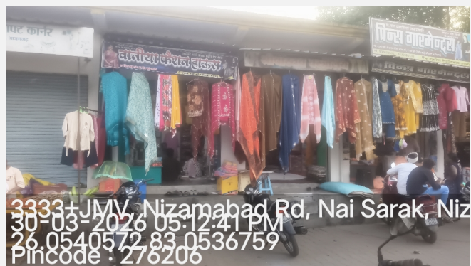
Shop Photo Outside