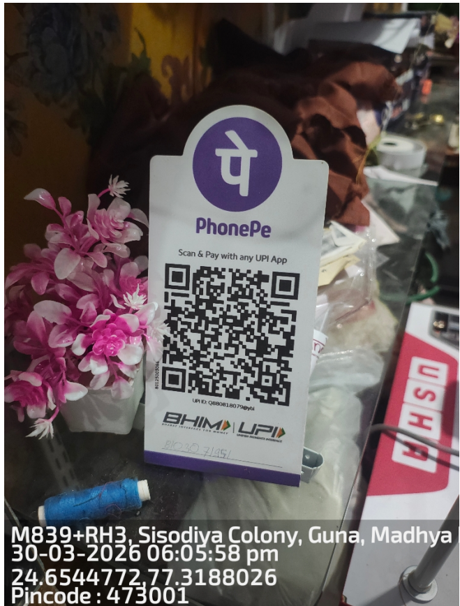
Photo with UPI Scanner