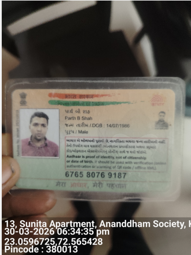
Photo of ID Proof