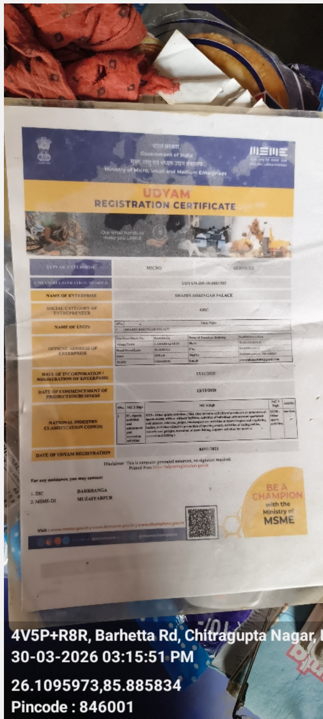
Photo of ID Proof

4V5P+R8R, Barheta Rd, Chitragupta Nagar, L 30-03-2026 03:15:51 PM 26.1095973,85.885834 Pincode : 846001