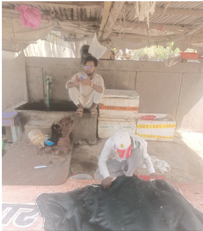
Savda, J Block 683, J J ... 30-03-2026 10:56:22 am 28.7033558,76.9788875 Pincode : 110081

Shop inside with inventory photos establishing that the inside is of the same shop where the front photo was taken