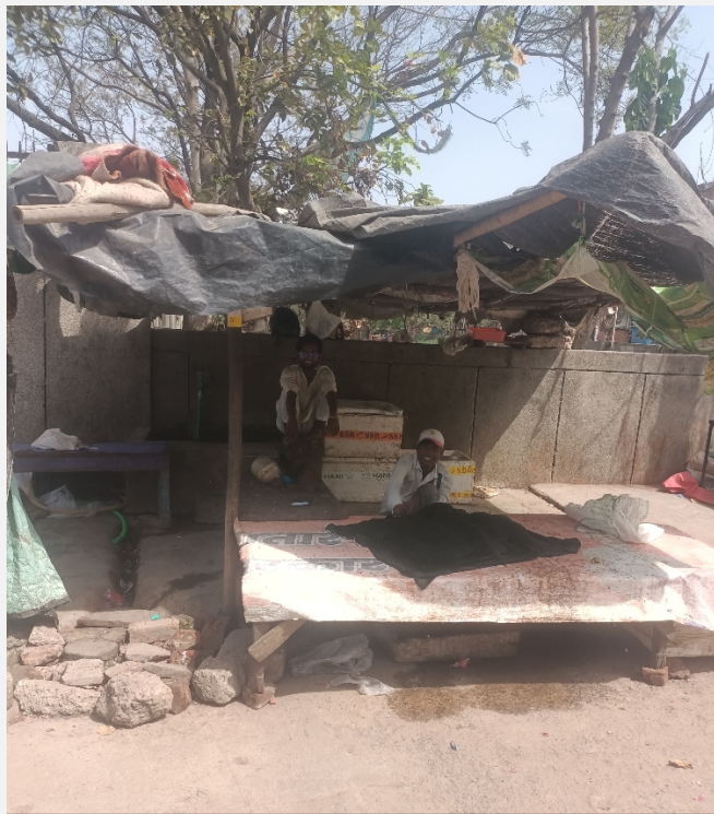
C-400, J J Colony, Sawda, New ... 30-03-2026 10:55:26 am 28.7033558,76.9788875 Pincode : 110081

Shop front with horizontal view covering the left & right of the shop establishing if the shop is an individual structure, in a marketplace, highway, isolated place, in a cluster framework.