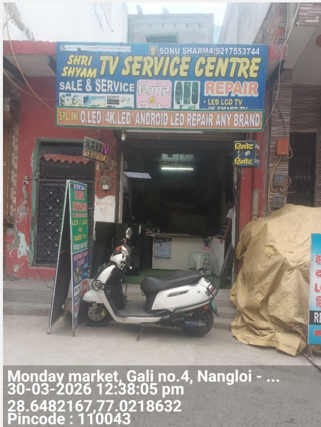
Monday market, Gali no.4, Nangloi - ... 30-03-2026 12:38:05 pm 28.6482167,77.0218632 Pincode : 110043

Shop front with horizontal view covering the left & right of the shop establishing if the shop is an individual structure, in a marketplace, highway, isolated place, in a cluster framework.