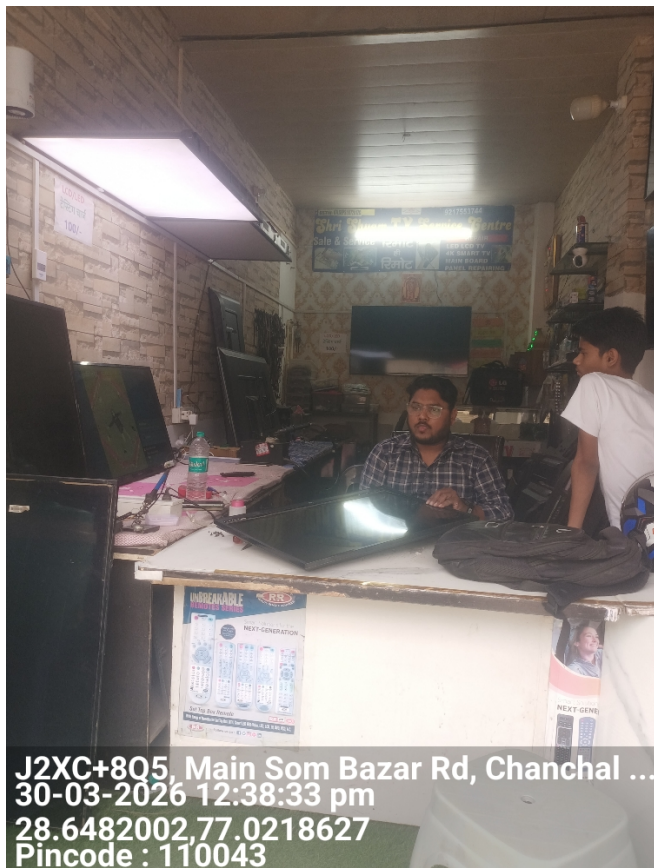
J2XC+8Q5, Main Som Bazar Rd, Chanchal ... 30-03-2026 12:38:33 pm 28.6482002,77.0218627 Pincode : 110043

Shop inside with inventory photos establishing that the inside is of the same shop where the front photo was taken