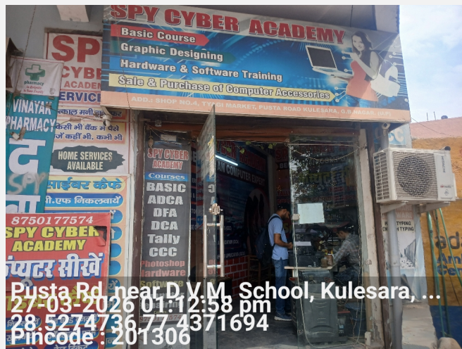
Shop Photo Outside