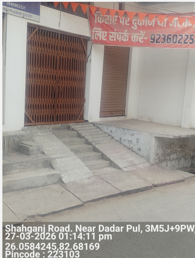
Photo of Stock