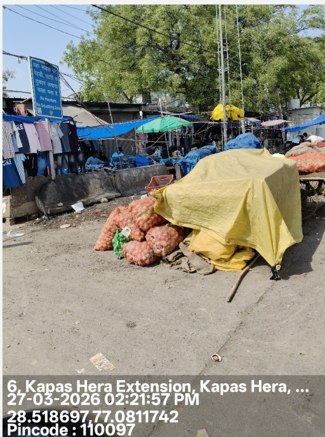
6, Kapas Hera Extension, Kapas Hera, ... 27-03-2026 02:21:57 PM 28.518697,77.0811742 Pincode : 110097